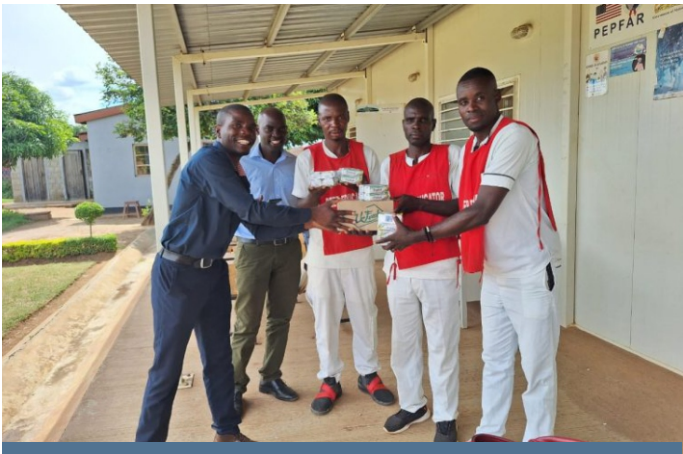
● TB in Prison Project