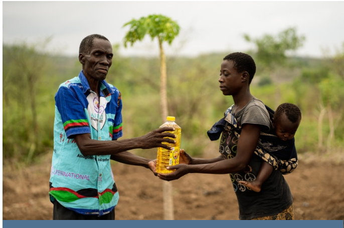
● Nutrition support in Neno