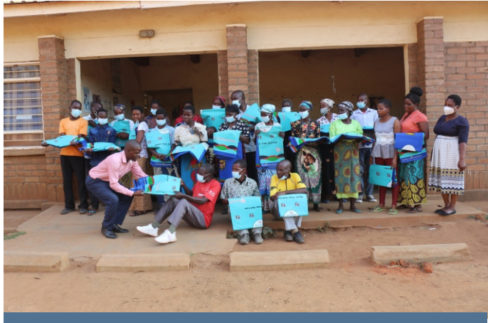
● Cloth distribution in Dedza