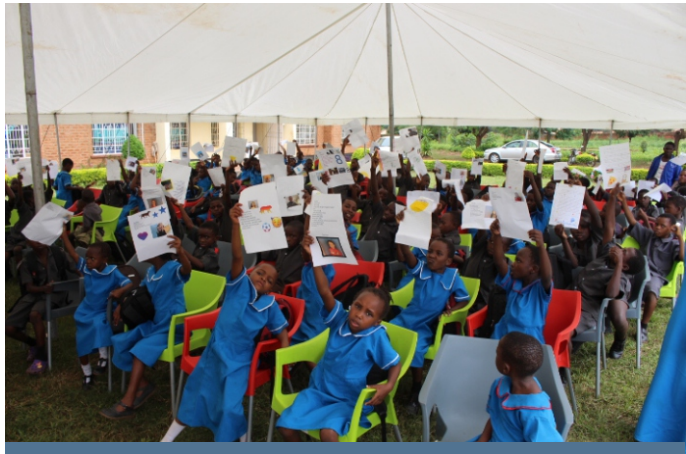
● PEN-PAL/OVC Children at Paradise TB Patients Trust Head Office