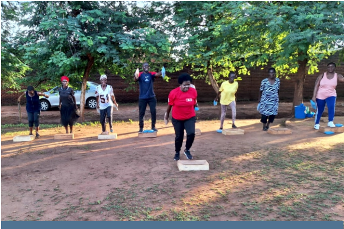
● Lung rehabilitation exercises